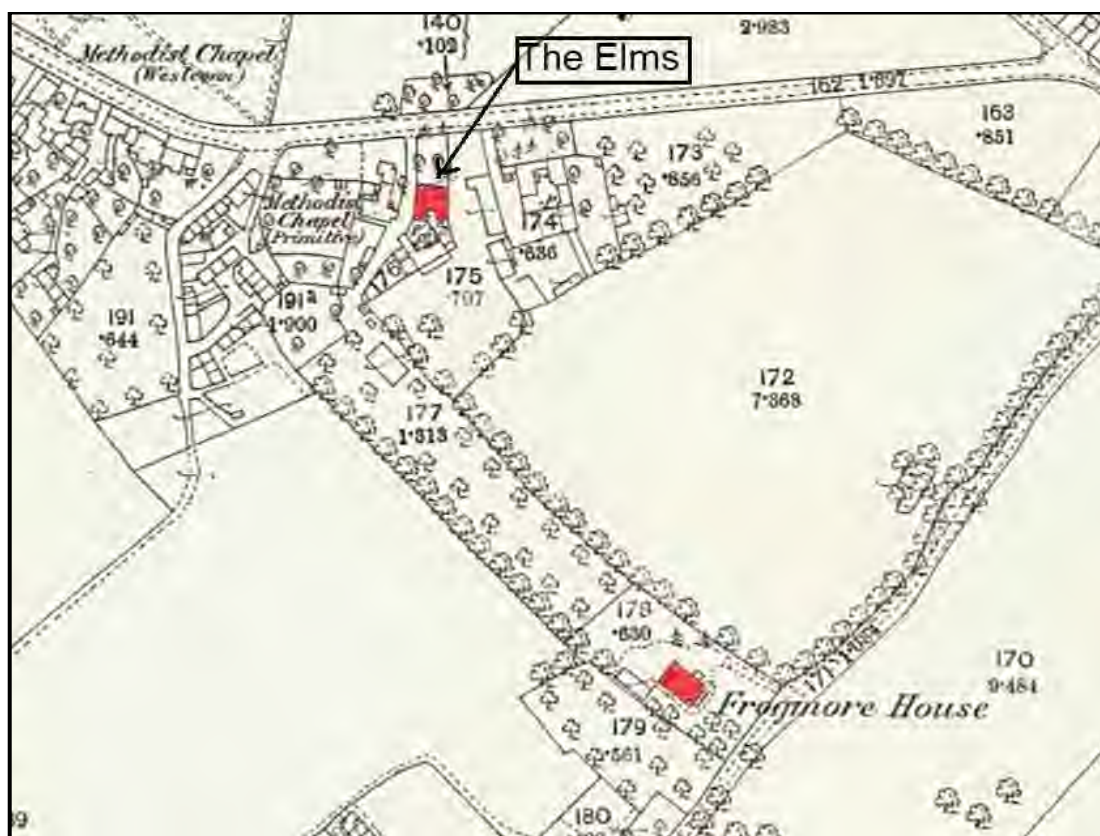
Figure 2 - Ordnance Survey Map Oxfordshire XXV.1 Surveyed in 1879, published in 1881 – detail showing Frogmore House and its relationship to Alfred Groves’ family home – The Elms. Annotations by the author. The road at the top of the map is Shipton Road.

This OS map shows that the house was already in this location by 1879, and judging from stylistic evidence it cannot have been built very much earlier. A build date sometime between 1875-1879 must be close to the mark.