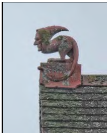
Figure 16 - Terracotta "Gladstone gargoyle" on property reputed to be in Taplow.