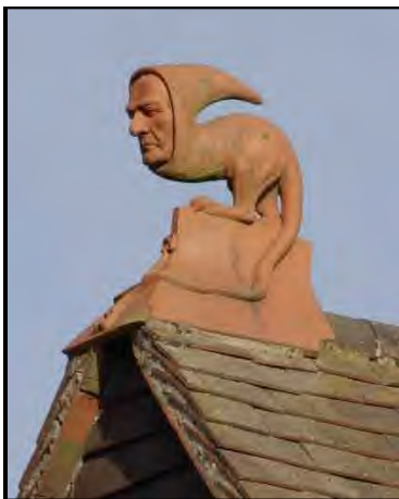
Figure 15 - Terracotta "Gladstone gargoyle" on the roof of The Limes in Penn, Buckinghamshire. Originally sited on the roof of 'Rayners'.

The Frogmore figure is not unique. A number of variants of this sculpture can be traced (figures 15, 16 and 17). There were undoubtedly others.