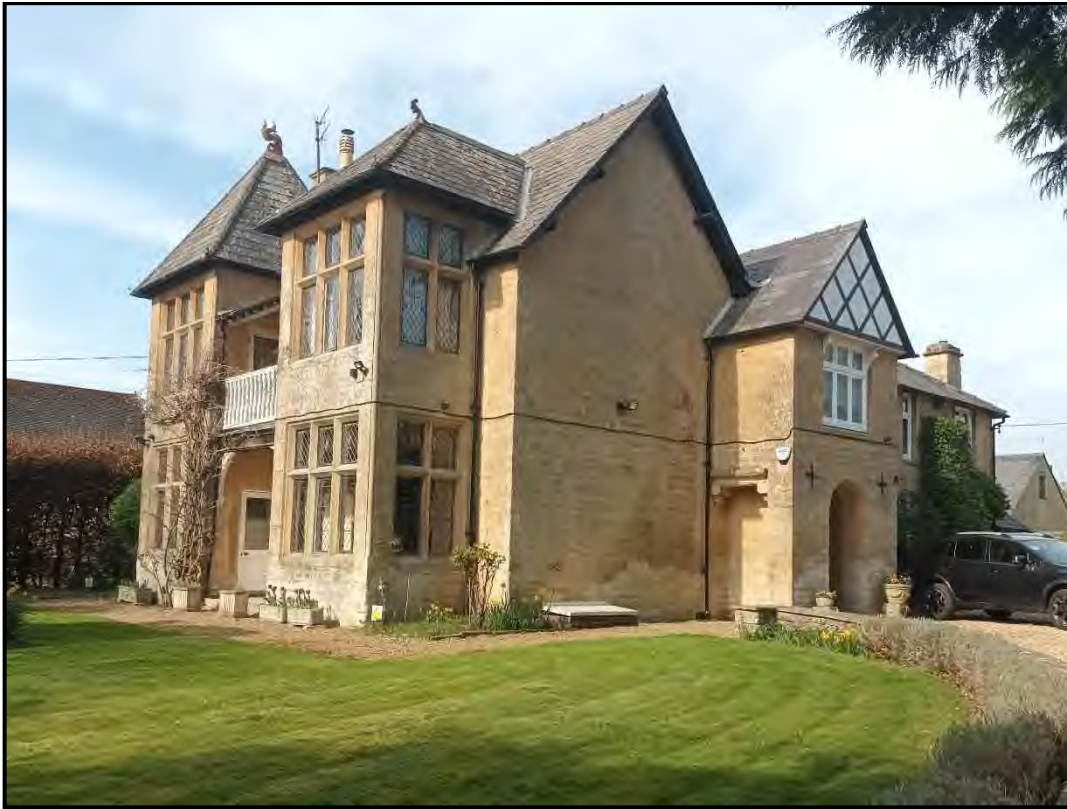
Figure 5 - Frogmore House, street facade, 2025.

The windows are glazed with leaded lights that contain clear and some coloured glass in a latticework pattern alongside some geometric designs. The forward corners of the two bays are detailed with a slim pencil bead (figure 1).