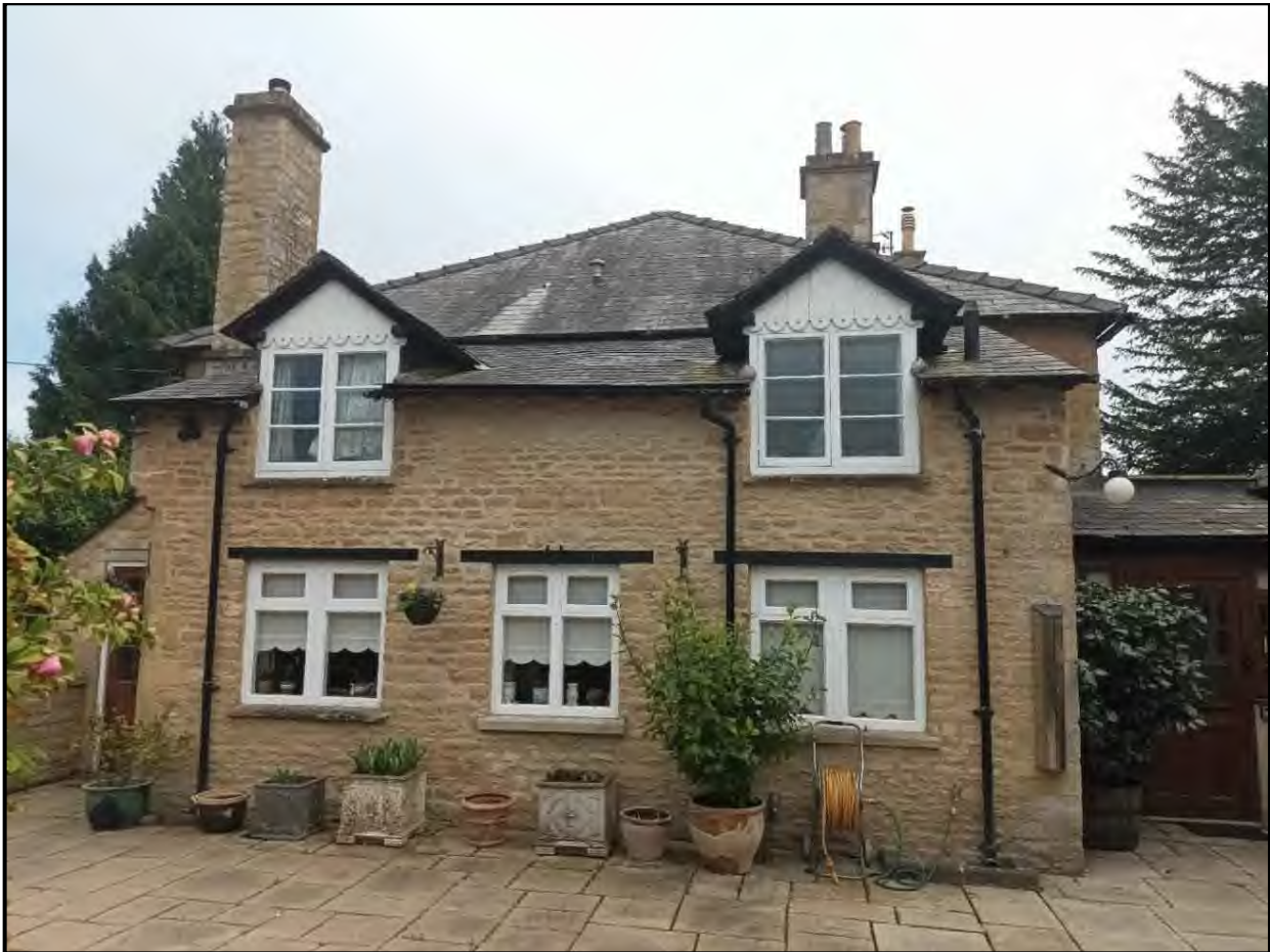
Figure 4 - View of the rear elevation of "Frogmore House", showing the later extension (about 1900), the central ground floor window was once a doorway. (Photograph 2025)

The most notable architectural feature of the house is the two projecting bays facing onto Frog Lane. These are symmetrical except that the left-hand bay is topped by a steep pyramidal roof, whereas the right-hand bay is topped by a shallower hipped roof. These two bays feature stone mullion and transom window openings. The street facing windows are six-light, and the lateral ones are four light (figure 5).