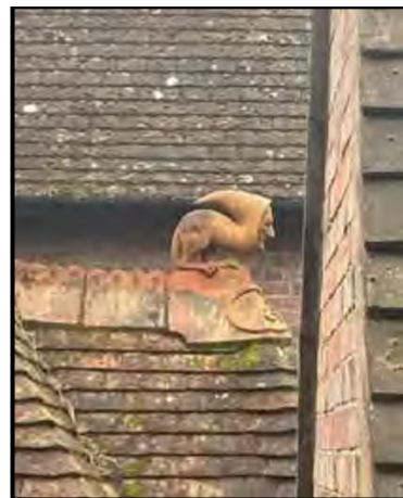
Figure 17 - Terracotta "Gladstone gargoyle" on Wardown House, Luton.

But why is he presented in the form of this hybrid creature and what is he doing on the roof of Frogmore House ? The deprecation of politicians in caricature already had a long history in print, and there are occasional sculptural examples on some churches and cathedrals. At St Giles in Camberwell there are gargoyles of Lord Salisbury; Gladstone; Lord Randolph Churchill; the MP and secularist Charles