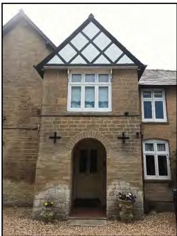
Figure 7 - Entrance porch.

The main entrance to the property, on the north-east side of the house, is formed by a two-storey porch. The entrance to the porch is through a simple round headed arched doorway. The upper storey has a six-light timber casement window to the front, the gable being filled with faux half-timbering in a diaper pattern. (figure 7).