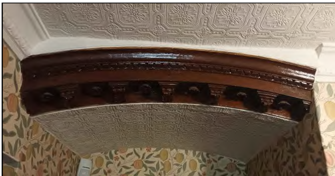
Figure 10 - carved framing to alcove arch in ground floor hallway.