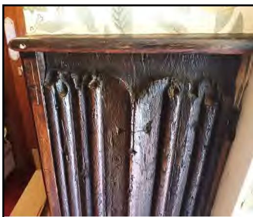
Figure 9 - detail of linen-fold panel to hallway.

The stairwell extends into a light-well which tapers up through the attic and is glazed by two roof lights which meet at the apex (figure 11).