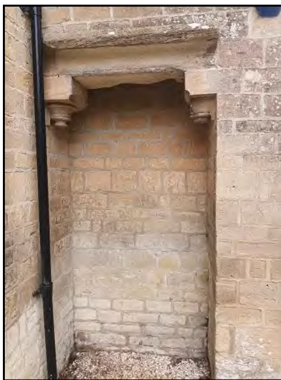
Figure 8 - Alcove to south-east flank of porch.

There is an unusual architectural detail to the south-east flank of this porch in the form of a shallow alcove (figure 8). The alcove is topped by a piece of weathered stone coving that forms a lintel, it is probably a piece of architectural salvage. It is supported by two impost-blocks with mis-matched moulded capitals; the crispness of these capitals suggests that they are contemporary with the build date of the house; perhaps fragments left over from other Groves' building projects. The whimsical