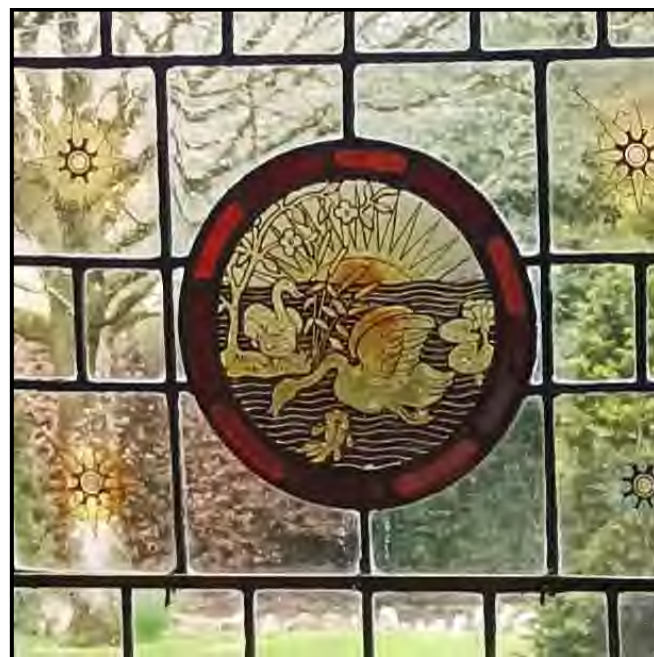
Figure 6 - detail of leaded window, 2025.

Internally the stonework of these bays is exposed. This is a feature of their masonry, a neo-Tudor pretence. The painted glass roundels inserted into the leaded lights feature scenes of natural history, including swans, fish, foxes, bats, and flora (figure 6).