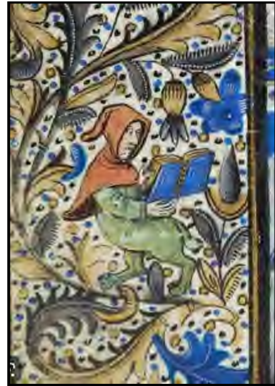
Figure 14 - Detail of illumination from Bruges Book of Hours, c1470, Morgan Library, New York, MS H. 7.

Whilst the form of the Frogmore gargoyle might be derived from fantastical medieval imagery, the portrait features of the face make it something else. The features can be identified as those of William Ewart Gladstone (1809-1898), the reforming liberal MP who served as Prime Minister on four occasions and served in parliament for over 62 years. The shamrock at the end of the figure's tail is a reference to Gladstone's involvement with Irish politics, and long-standing support for Irish Home Rule. Every year, on St Patrick's day, Irish well-wishers would present him with a sprig of shamrock.