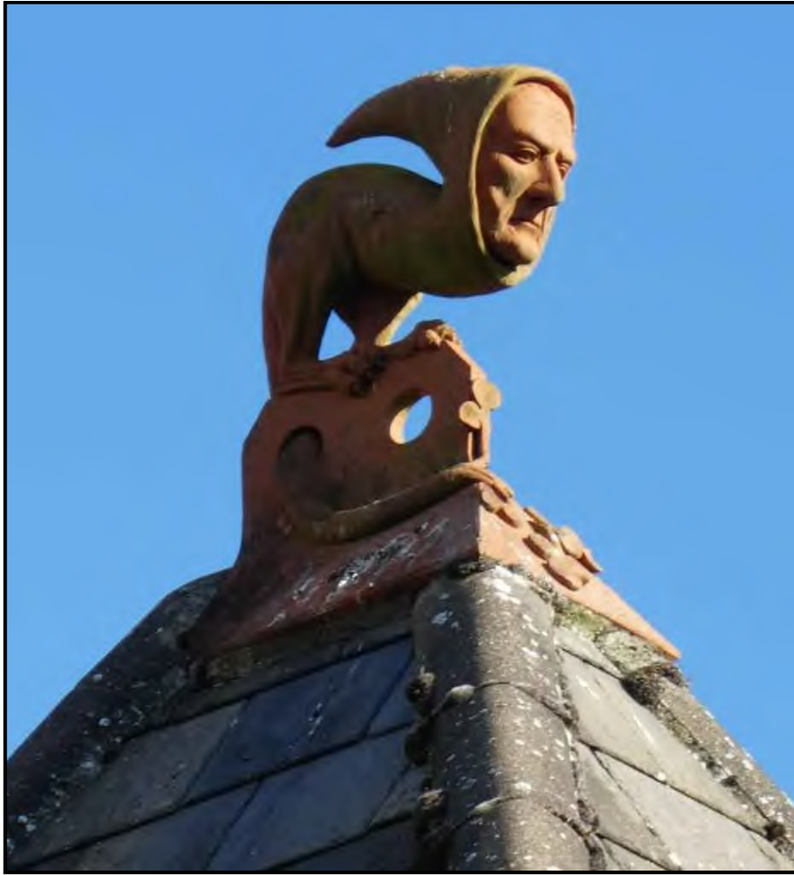
Figure 12 - terracotta figure on apex of the south-west bay.

The terracotta gargoyle type figure that adorns the roof of Frogmore House has long been a mystery. It takes the form of a hybrid man-beast figure where the cowled head of a man is attached to a hunched animal-like body that has two clawed feet and a tail that snakes through a hole in the ridge tile on which he perches. The tail curls around to the front of the tile and terminates in a shamrock design, a clue to his identity (figure 12).