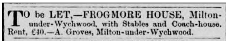
Figure 18: Notice in Jackson's Oxford Journal of 7 January 1882

From its completion Frogmore House appears to have had an interesting series of rent-paying tenants. It has already been noted that Alfred Groves was advertising this property to rent in 1882 (figure 18).