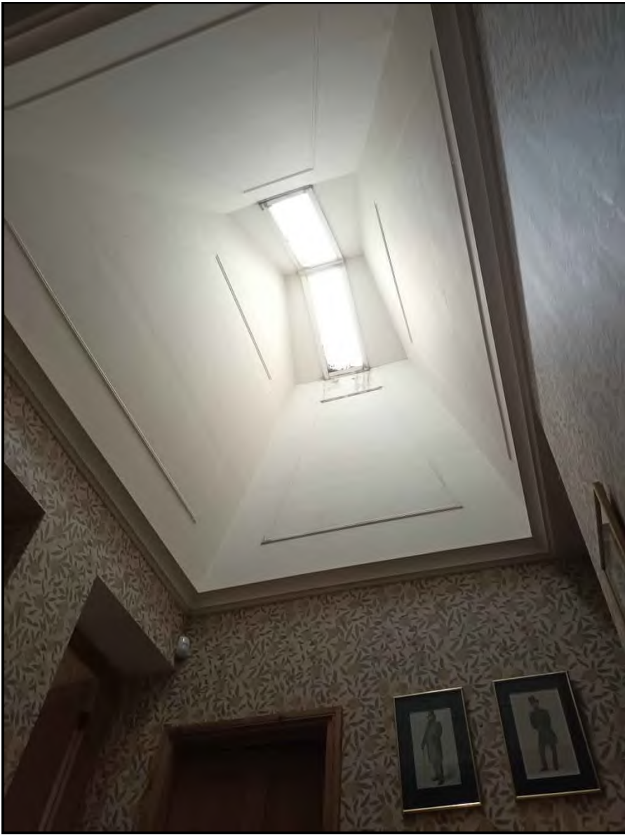
Figure 11 - view of lightwell above hall and staircase.