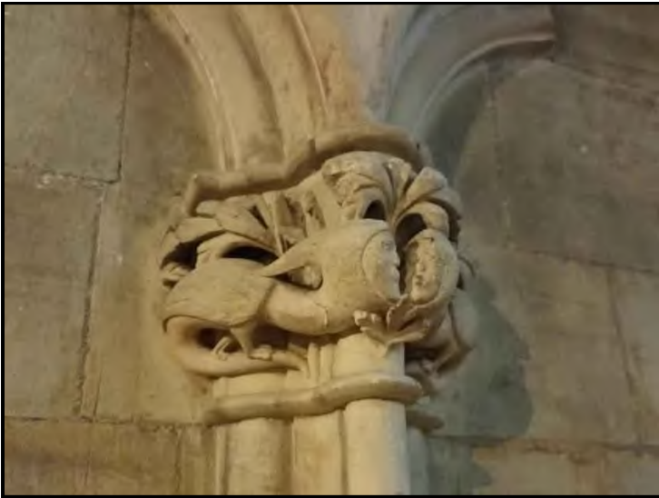
Figure 13 - Capital from arcade leading to the Chapter House in York Minster, 14 th Century.