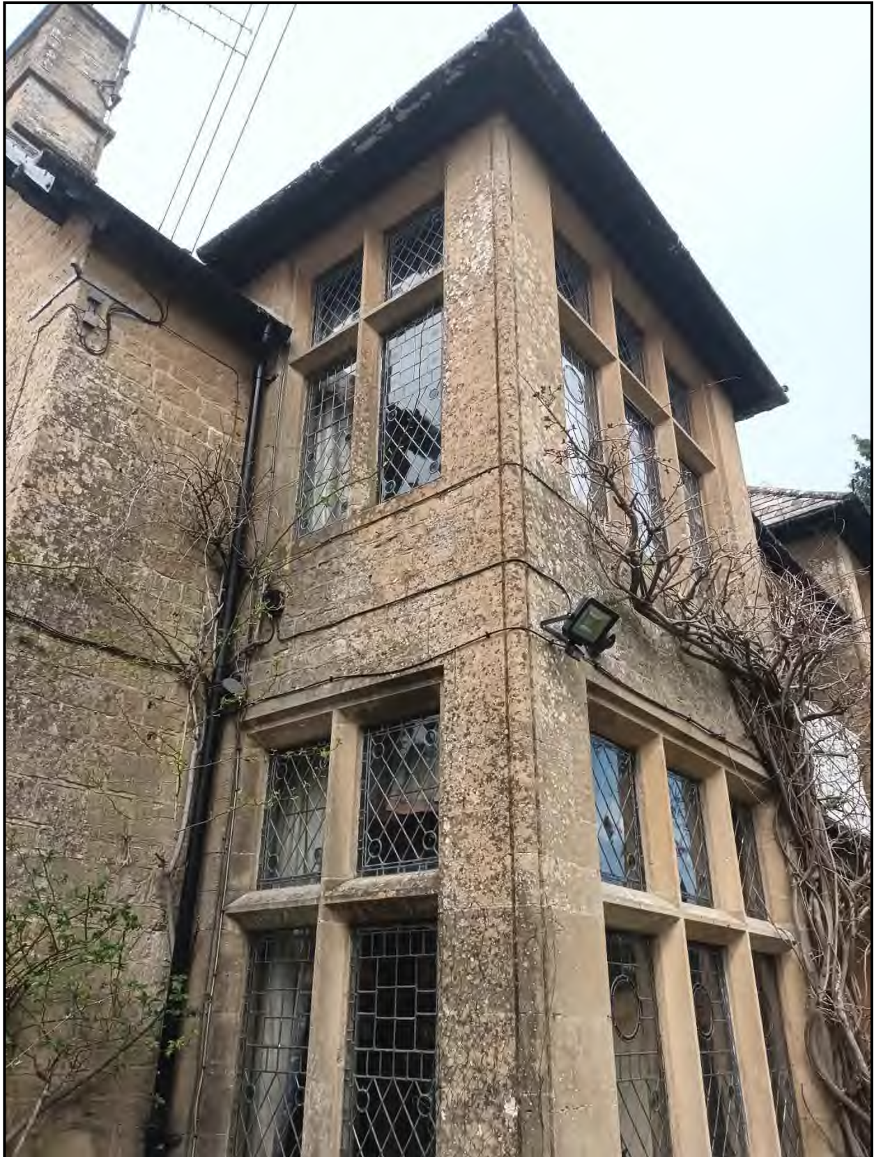
Figure 1 - Forest Gate, detail of front bay, 2025.